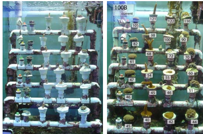
Figures 1a & 1b. Indoor tank setup at Mote's Tropical Research Laboratory at the beginning (1a; left) and end of a 12 week trial (1b; right). Coral species from left to right: Montastraea annularis , Acropora cervicornis , Acropora palmata , Montastraea cavernosa . Numbers represent light readings ( \mu\text{mol m}^{-2} \text{s}^{-1} ) next to each colony (1b).